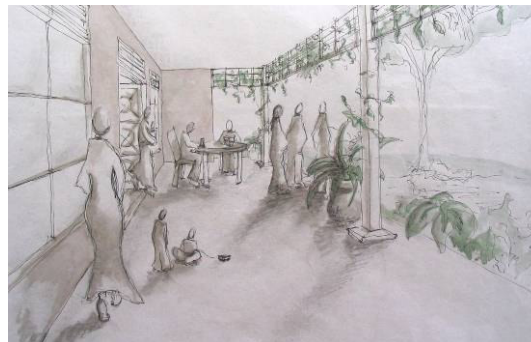
Veranda of Director's Home

A director will live onsite to provide full time leadership to the trainers, administrative and support staff. The home will have adequate living space for a couple with children, as well an area as to entertain visitors, friends and staff.