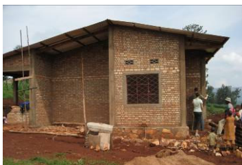
Administration building under construction

The administration building is almost complete. This building will have offices for the director, professional counselor, accountant, and secretaries, and a meeting room.