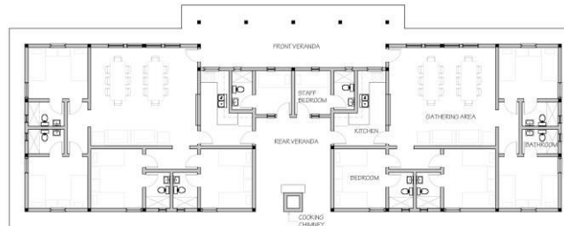
Floor plan of Student Cottage

The students will live and gather in the student cottage during training. Each cottage is made up of two duplexes, each capable of housing 16 students in four bedrooms. These sixteen students will meet and eat together in their duplex's gathering room – creating a community that is conducive for group teaching, sharing and forgiveness. A front veranda will overlook a peaceful valley below. The trainer's cottage will be a single duplex with four bedrooms for 8 trainers.