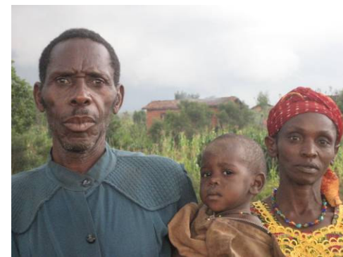
Will they live in Peace?

Among the poorest countries in Africa, Burundi has been torn apart by cyclical genocide and civil war the past 40 years. Hundreds of thousands have been killed and maimed. Fortunately, now tired of the violence, free elections have been held, a unity government has formed, and a fragile peace exists. But deep wounds, generational ethnic hatred, and desire for revenge are hard to leave behind. These dark seeds of future cycles of violence lay waiting in many hearts today.