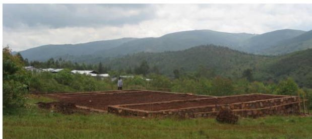
Chapel Foundation overlooking valley

The chapel will be a place for all of the students and trainers to meet together for lecture and large group exercises. It will contain a large auditorium capable of holding 150 people, restrooms and a storage room. It is also under construction.