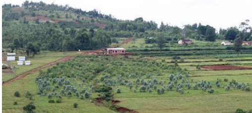
Training Center Site

The gracious hand of God is already upon this project. Land for the center was donated by the Muslim governor of Gitega, who recognized the tremendous healing that has taken place through THARS. The construction of the administration building and chapel are already underway.