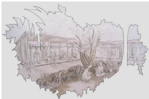
Listening Rooms opening onto Garden

One-on-one counseling will occur in the listening building. A trainer will help the student process through the trauma they have experienced. The student's own need for healing and forgiveness will be gently revealed to them. As they embrace Christ and realize how much they have been forgiven, they will have the spirit to forgive their enemies. Each listening room opens onto a healing garden of God's creation, which testifies to His eternal nature and divine power to forgive and restore.