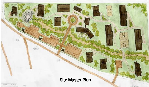
Site Master Plan

A training center is needed to lead the hurting to Christ, set them free, and train them up to go out and counsel others. Recognizing the effective healing THARS is doing, the government has given a 5-acre (2 hectare) site on which to create such this center. The site is in a peaceful, beautiful valley in the cool, mountainous heartland of Gitega, far from the noise and confusion of the city.